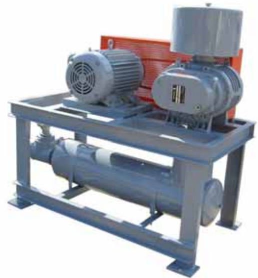
TT-6M-30 Belt Drive