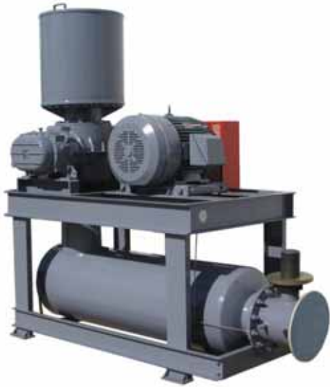
TT-7028-150 Belt Drive