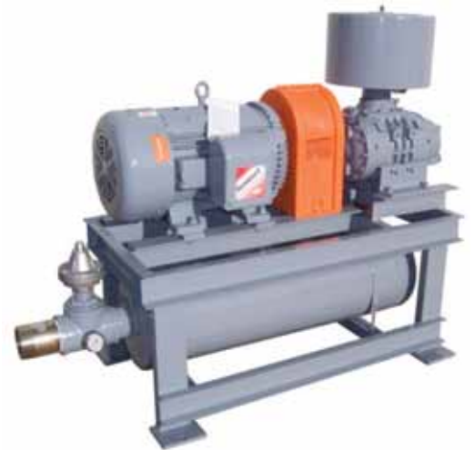
TTD-4506-50 Direct Drive